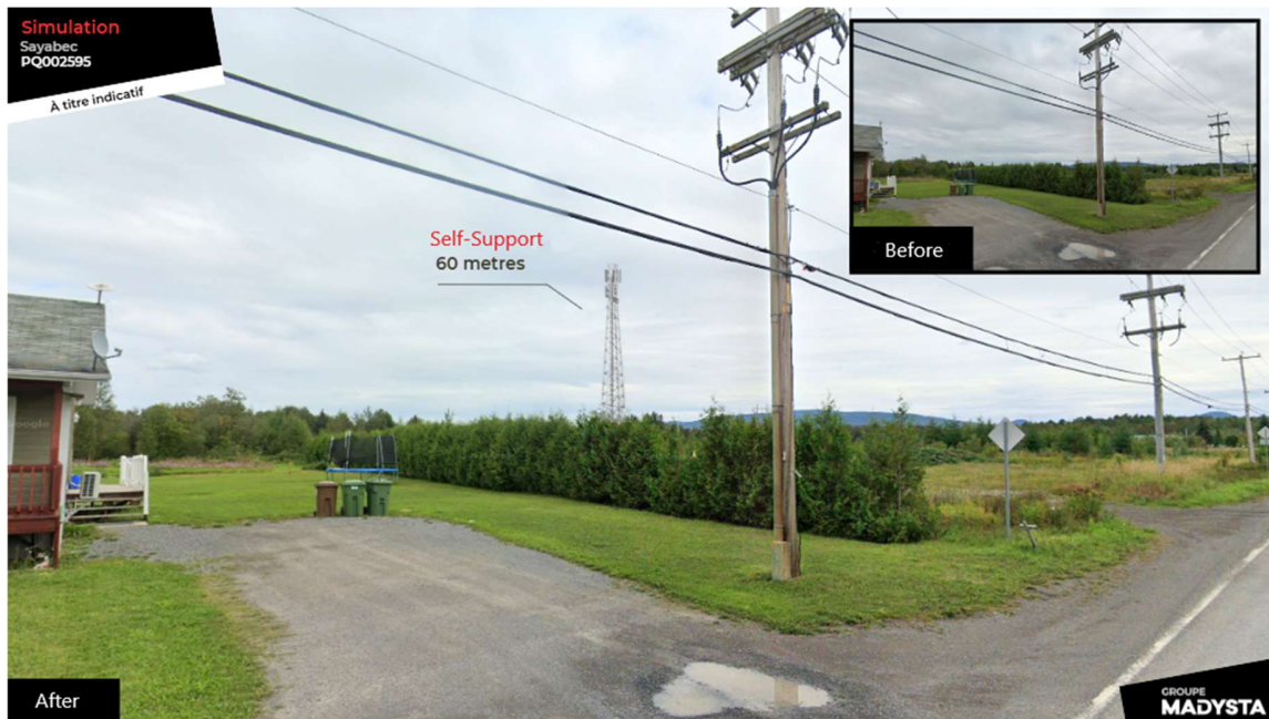
View from Rioux Road, towards South