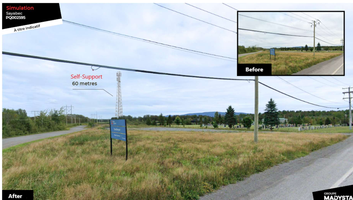
View from Rioux Road, from the site entrance